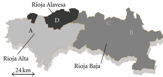
FIGURE 1: Location of the four wineries in the three subzones of the Appellation of Origin Rioja.